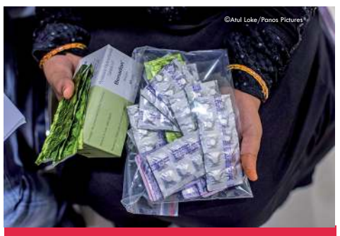
A DR-TB patent showing her TB medication in Mumbai, India.

endTB's clinical trial (a partnership between MSF, Partners in Health, Epicentre, Harvard Medical School and the Institute of Tropical Medicine Antwerp, financed by UNITAID), of which MSF is sponsor, will begin in late 2016. In collaboration with ministries of health, the clinical trial will involve 750 patients in six countries (potential sites include Georgia, Kazakhstan, Kyrgyzstan, Lesotho, Peru, South Africa), of which Georgia, Kyrgyzstan and South Africa are MSF projects. It will study the safety and efficacy of several "user-friendly" MDR-TB treatment regimens, each containing either bedaquiline, delamanid or both, in combination with old or repurposed drugs, for nine months, and without injectables.